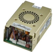
F Type (U-Chassis with top built-in fan): 3.2(W) x 5(L) x 2(H) inches.