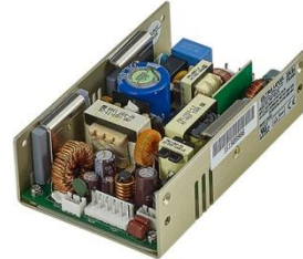
U Type (U-Chassis only): 3.2(W) x 5(L) x 1.5(H) inches.