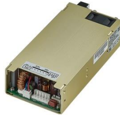
E Type (Enclosed with end built-in fan): 3.2(W) x 6.5(L) x 1.6(H) inches