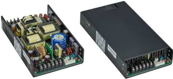
RL0402DU Series (U-Chassis Type): 8(L) x 5(W) x 1.6(H) inches. RL0402DE Series (Enclosed Type): 9(L) x 5(W) x 1.6(H) inches.