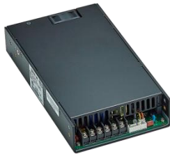
F type: 8(L)×5(W) × 2 (H) inches E type: 9(L)×5(W) × 1.6(H) inches