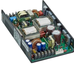
U type: 8(L) x 5(W) x 1.6(H) inches