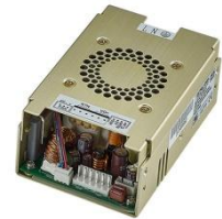
F Type (U-Chassis with top built-in fan): 3.2(W) x 5(L) x 2(H) inches.