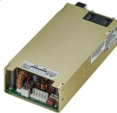
E Type (Enclosed with end built-in fan): 3.2(W) x 6.5(L) x 1.6(H) inches