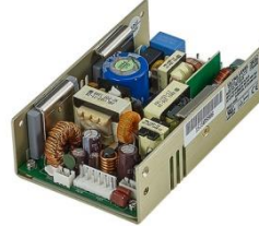
U Type (U-Chassis only): 3.2(W) x 5(L)x 1.5(H) inches.